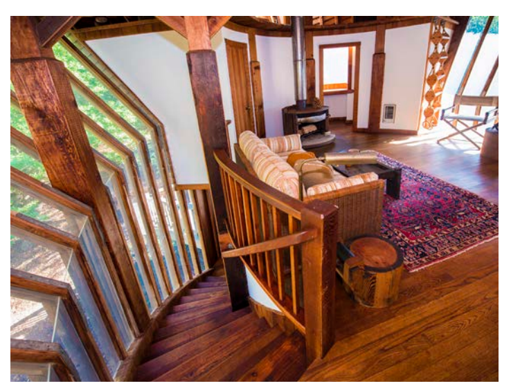
Experts in real estate sales and premium vacation rentals at Stinson Beach and Seadrift since 1973 www.stinsonbeachtowerhouse.com www.seadrift.com