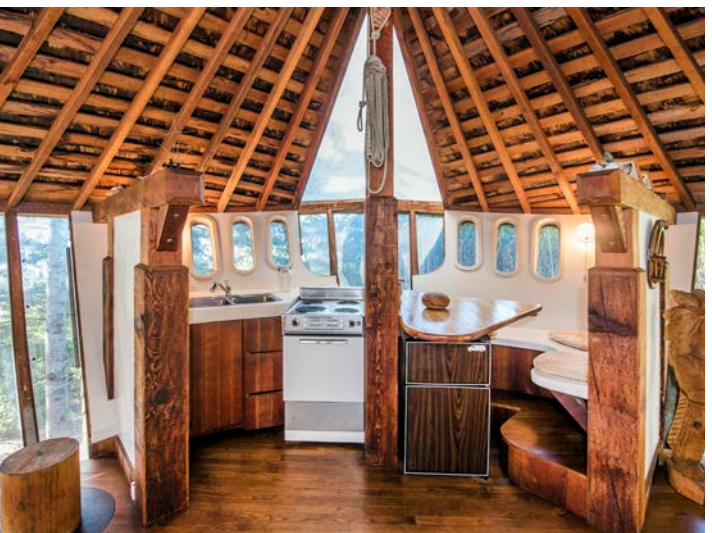
Experts in real estate sales and premium vacation rentals at Stinson Beach and Seadrift since 1973 www.stinsonbeachtowerhouse.com www.seadrift.com